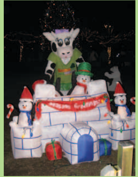
Moola the Cash Cow at Winter Wonderland.

Financial Tip: Pay bills online and on time. You'll save time and money, eliminate late fees and improve your credit score.