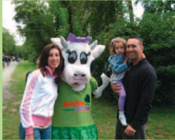
Moola the Cash Cow at SeptemberFest.